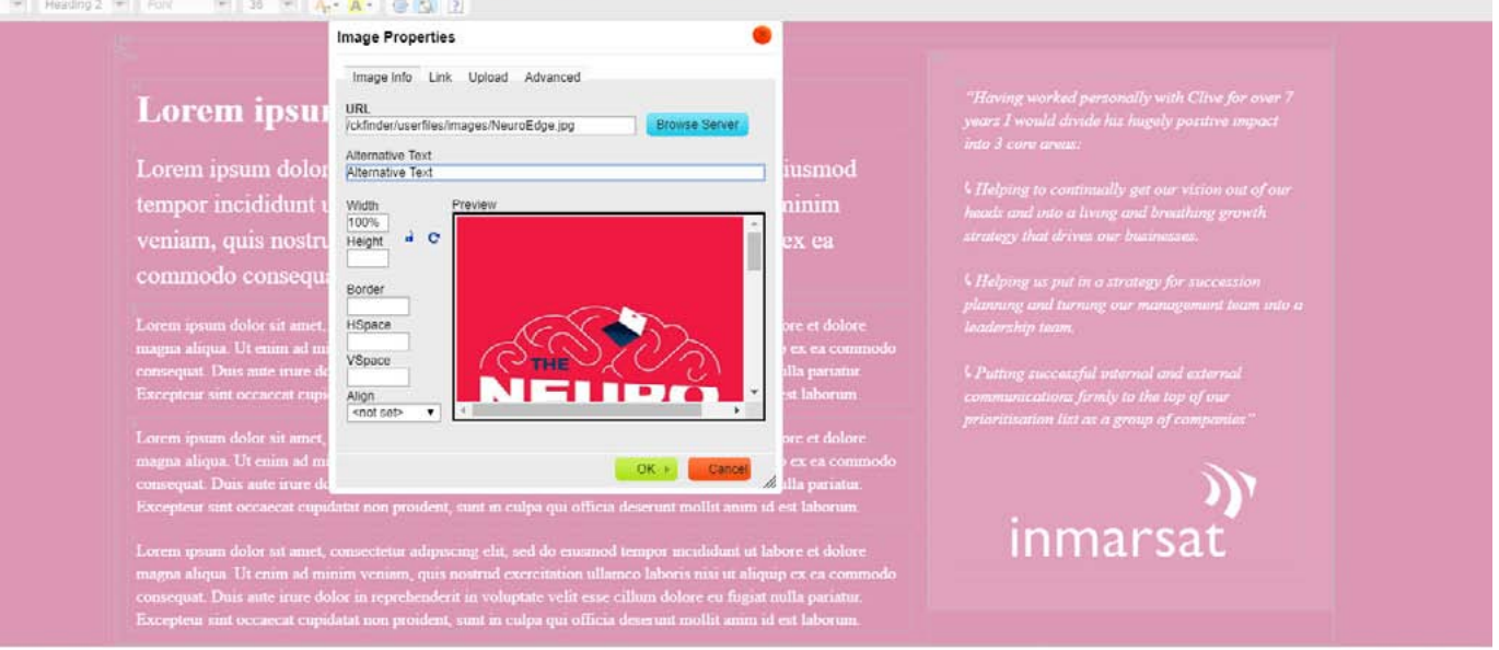
Figure 4 Uploading images.

Tip: For responsiveness across all screen sizes, ensure Width is set to a percentage% of the cell size <div class> and not a pixel size. There is no requirement to define a Height.