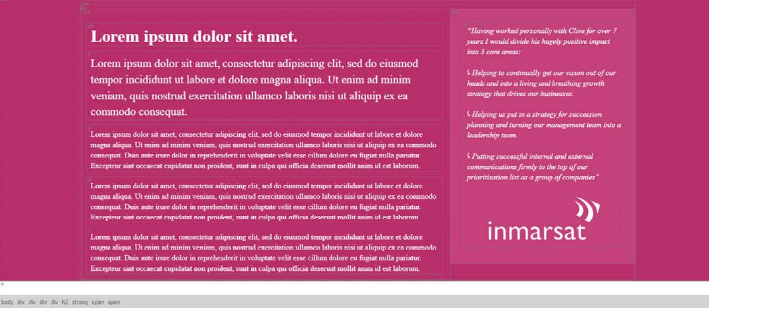
Figure 3 WYSIWYG editor.